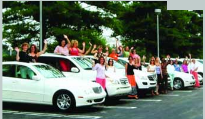
Pennsylvania Area Manager's retreat, August 2005.

teams, too: Thanks, every one of you make my day, every day. Thanks to my supportive and helpful crossline. Who would have thought you could build a business where others will help you, even when it does not help them? I wanted to list you all — but it would not fit on this page.