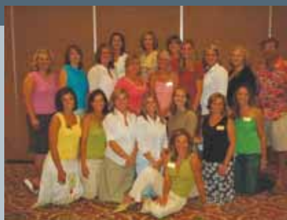
Members of Gena's Nation.